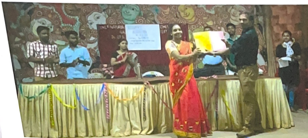
Various events at the association function