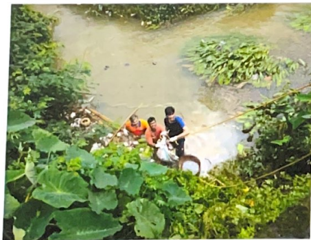
Removing the plastic waste from Poonur river

NSS units of this college in association with NSS District committee cleaned the Poonur river on 20 th August 2017. 10 NSS volunteers actively participated in the program.