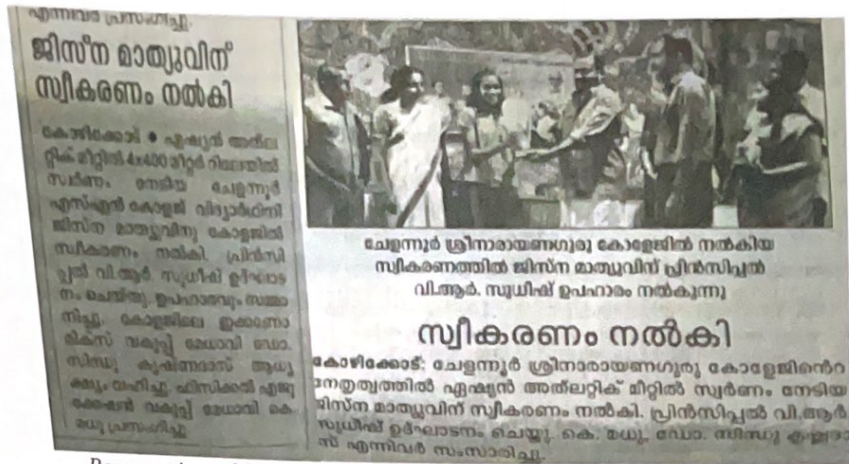
Paper cuttings of the function