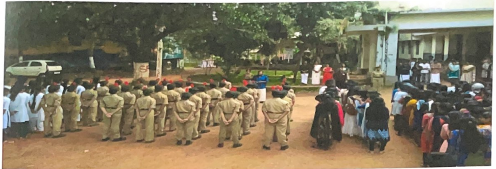
Principal's Address Independence Day