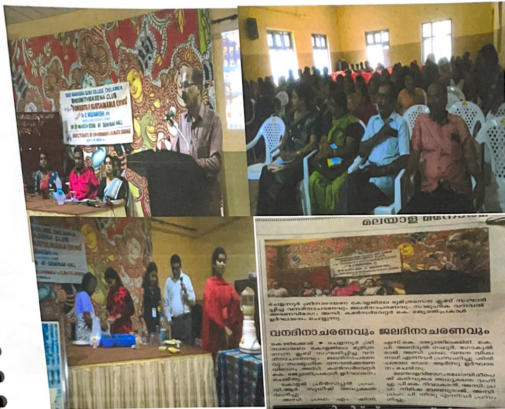
Various Events at the program