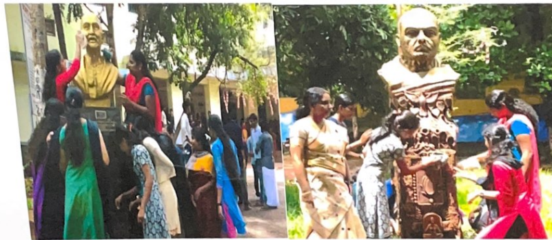
Cleaning of the Statues of Mahathma Gandhi and Sree Narayana Guru