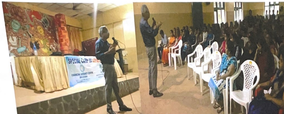
Sessions in Progress

The Commerce department in association with Financial Literacy Centre Balussery and Canara Bank organised a special camp on going digital. The liquidity crisis due to demonetisation and the propaganda for cashless economy prompted the department to organise such an event. All the commerce students and also the interested students from other disciplines were the beneficiaries of the program. They clearly demonstrated the possibilities of plastic money, e banking, mobile banking etc. to the students.