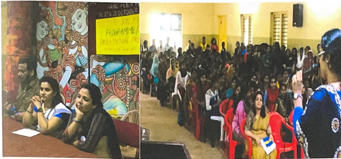
Inaugural function and Motivation class