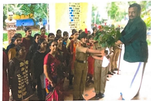
Principal inaugurating the environment day celebrations