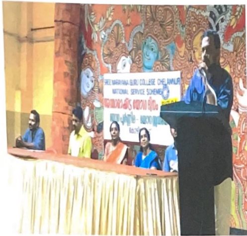
Yoga Purnima inaugural function