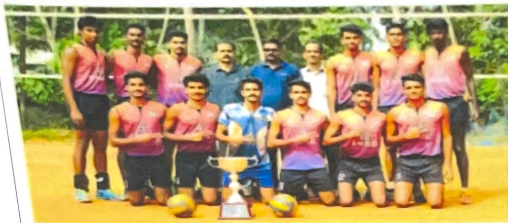
കാലിക്കറ്റ് യൂണിവേഴ്സിറ്റി ഇൻറർസോൺ വോളിബോൾ ചാമ്പ്യൻഷിപ്പിൽ ജേതാക്കളായ ചേളന്നൂർ എസ്.എൻ.ജി. കോളേജ് ടീം