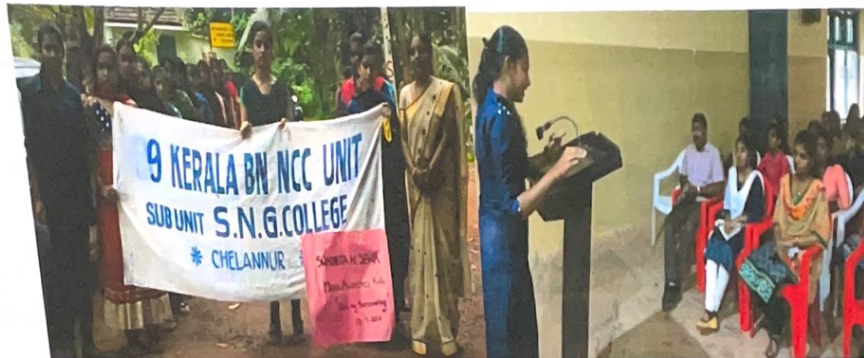
Beginning of the awareness rally