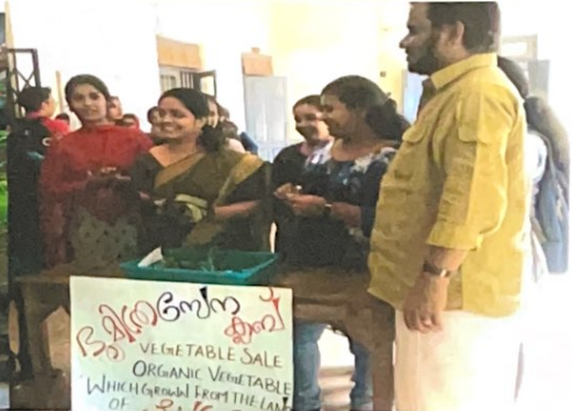
Various stages of our Organic farming activities