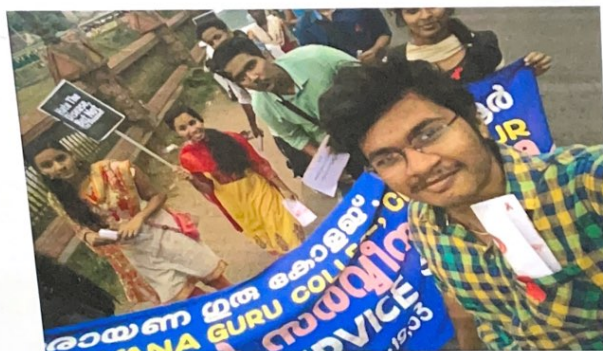
Our students at the Rally

The NSS volunteers of the college took part in the AIDS Day awareness rally at Kozhikode. From Mananchira square to Tagore hall Kozhikode followed by various awareness programmes.