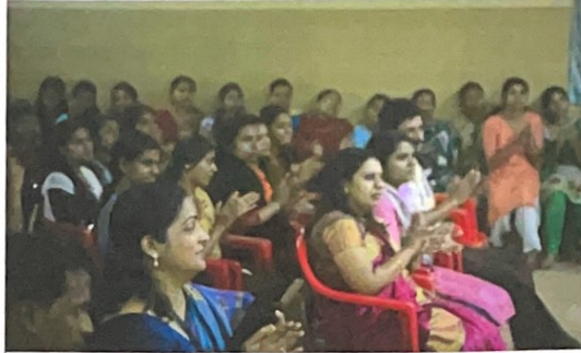
Audience of the function