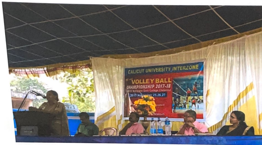
Closing ceremony of the championship

The college hosted the Calicut University Inter Zone Championship on 25 th , 26 th and 27 th November 2017. Twelve colleges coming under the University played in the championship. The college team won the championship by defeating Devagiri College team in three direct sets.