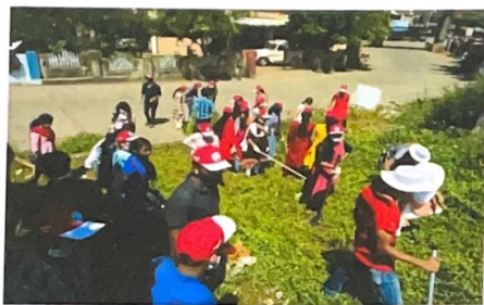
Cleaning in progress

The two NSS units of the college actively participated in the cleaning of Calicut Railway station. This program was organised as part of Swatch Bharath Abhiyan.