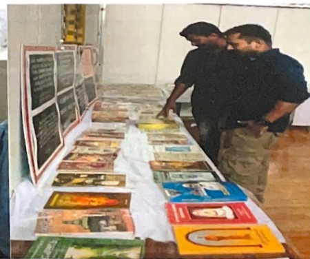
Alumni member at the exhibition