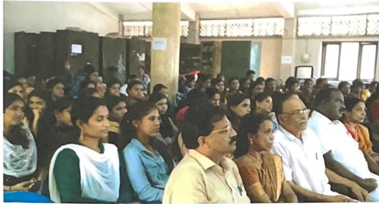
NCC Volunteers attending the program

NCC Cadets of the college participated in the mosquito eradication campaign organized by Legal Service Society on 18/7/2017. Cadets visited the houses in Chelannur Panchayath and gave them awareness regarding rain borne diseases and the steps that should be taken to prevent it. 25 cadets participated.