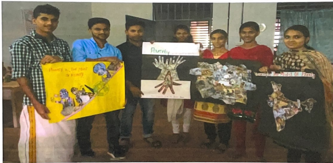
Prize winning Collages

Economics Department organized a collage competition on 9/8/2017. The topic of the competition is POVERTY IN THE MIDST OF PLENTY. Students of final B.A Economics bagged first prize.