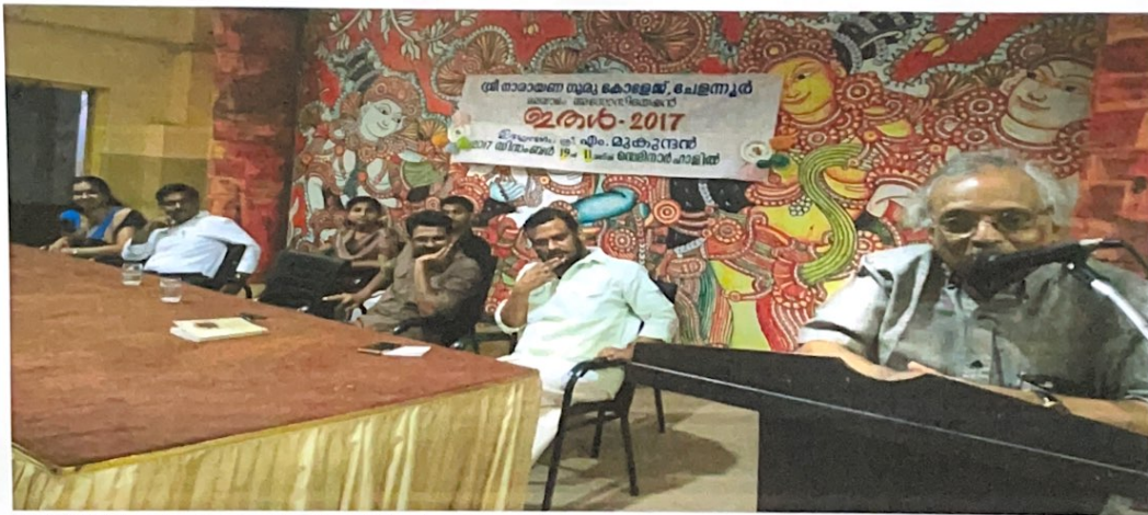
Shri. M Mukundan Inaugrating the Malayalam Association